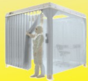
Clean Air Tent