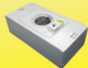
Fan Filter Unit